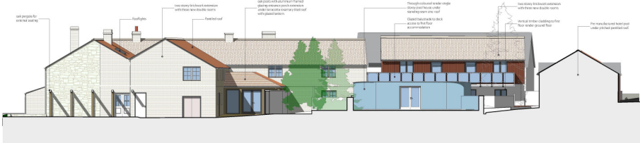
PROPOSED WEST ELEVATION (1:100)