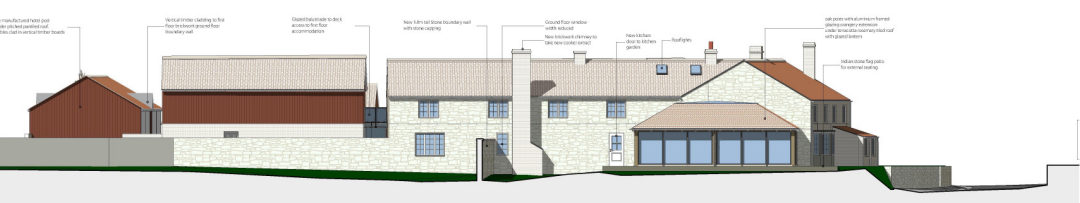
PROPOSED EAST ELEVATION (1:100)