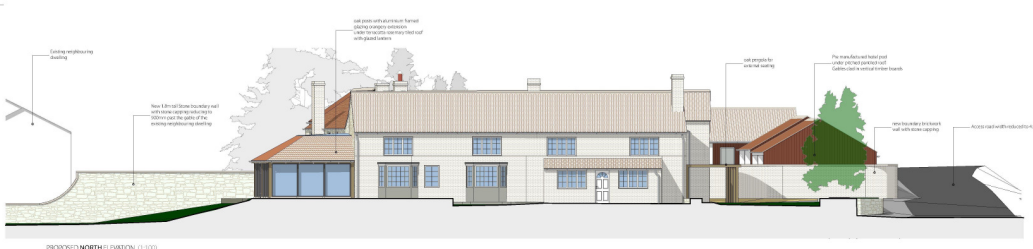
PROPOSED NORTH ELEVATION (1:100)